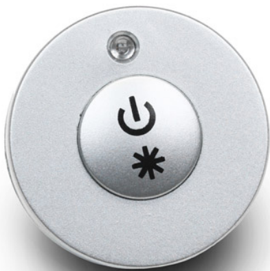
RF Remote (Transmitter)