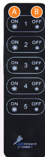
5 ZONE REMOTE Fig. 1

A: ON BUTTON Turns On And Controls Brightness Up